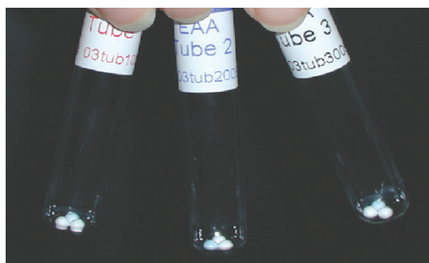
Figure 3. Colour coded tubes containing lyophilized reagents for EAA test kit. Tube 1 (red label): measures baseline neutrophil activity; Tube 2 (blue label): contains reagents to detect circulating LPS; Tube 3 (black label): contains reagents and excess LPS to detect maximum oxidative burst of a patients' neutrophils.

Blood samples for EAA testing must be collected using EDTA anti-coagulant blood collection tubes. A minimum of 2.5 mL of whole blood is required for the EAA assay. Collected samples may be stored refrigerated or on ice for up to 3 hours without compromising the assay results. A maximum of 5 patient assays and 1 QC test may be analysed at one time. The total run time for a batch of 5 assays is 20 minutes. The complete EAA turnaround time is 60 minutes.